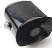
DSP-15 EExmN, 25W

Ex horn speaker for TFIX-V2 stations, 8 Ohm