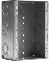
3 Gang Flush Mount back box