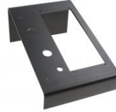
DUAL DESK STAND