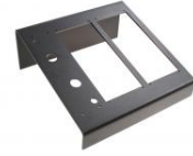
TRIPLE DESK STAND