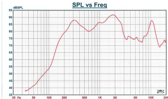
SPL at different frequencies at 1W/1m sine wave.